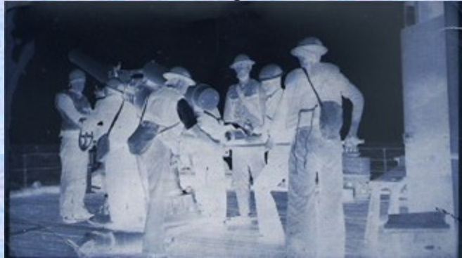
The imperialist died with their boots on

case Oneghus discovered it, but ego drove Yokel to put it in his wall safe. Lying for anyone to pick it up, that is if anyone dared enter his home. And he knew Oneghus would dare, for Yokel had a desire to be caught to show the world he was a genius.